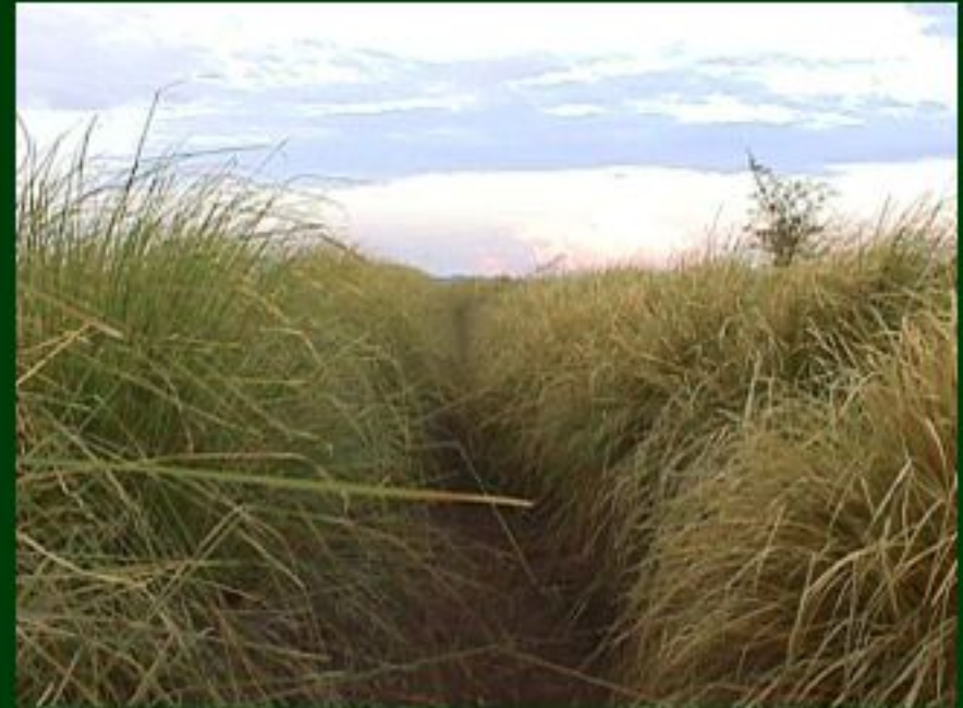
Madagascar - Vetiver stabilizes this irrigation canal