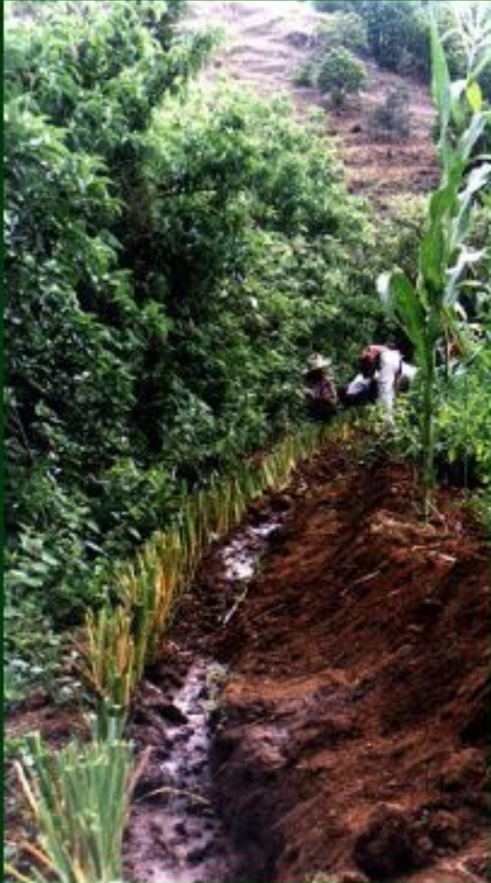
Mexico - Planting by hand