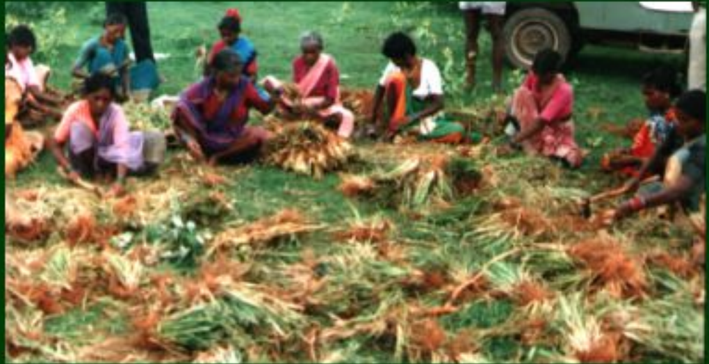
India - Preparing planting material