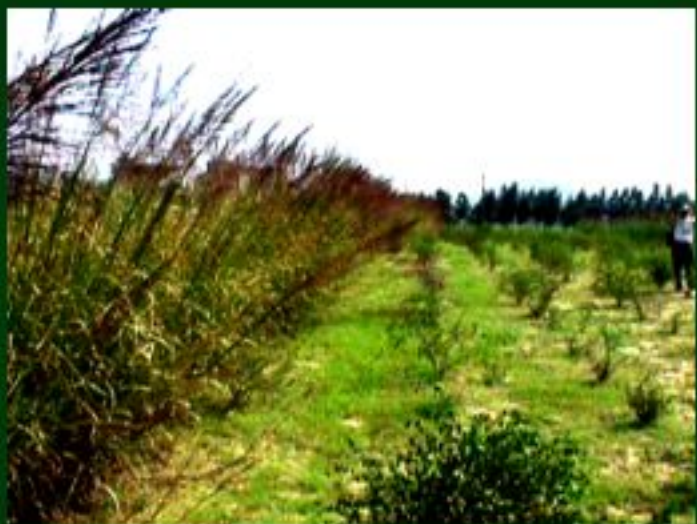
China - VS for wind erosion control