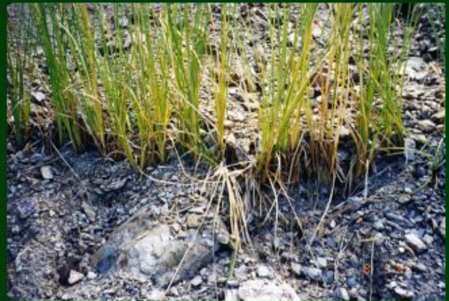
Right - Australia - Stone quarry rehabilitation using Vetiver System