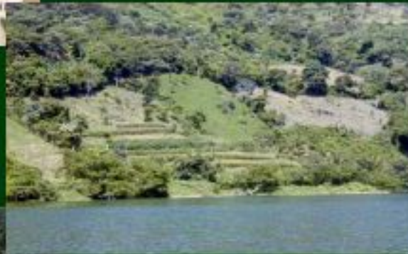
Costa Rica - vetiver used to protect tobacco crop