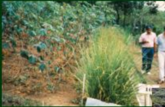
Columbia - CIAT vetiver - cassava trial on 12% slope