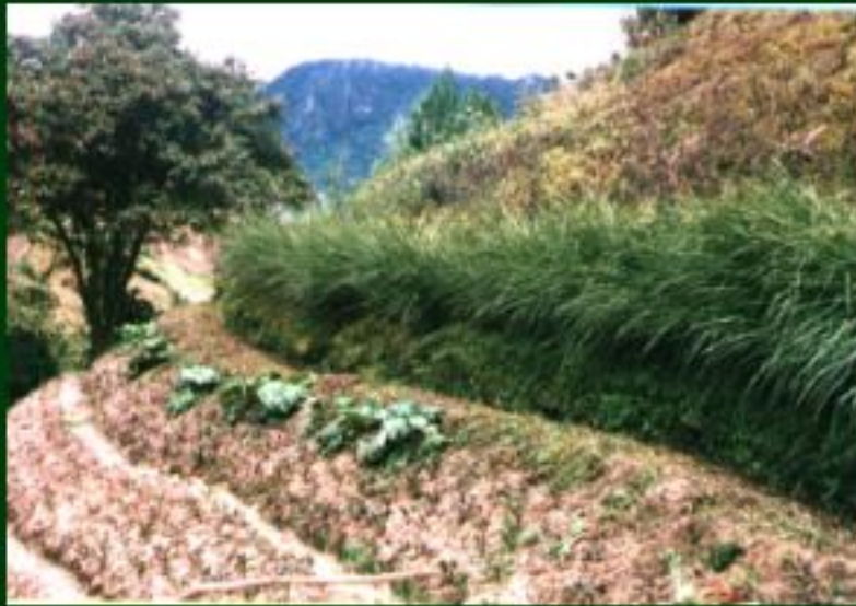
Panama - Vetiver hedge on a steep slope in Chiriqui