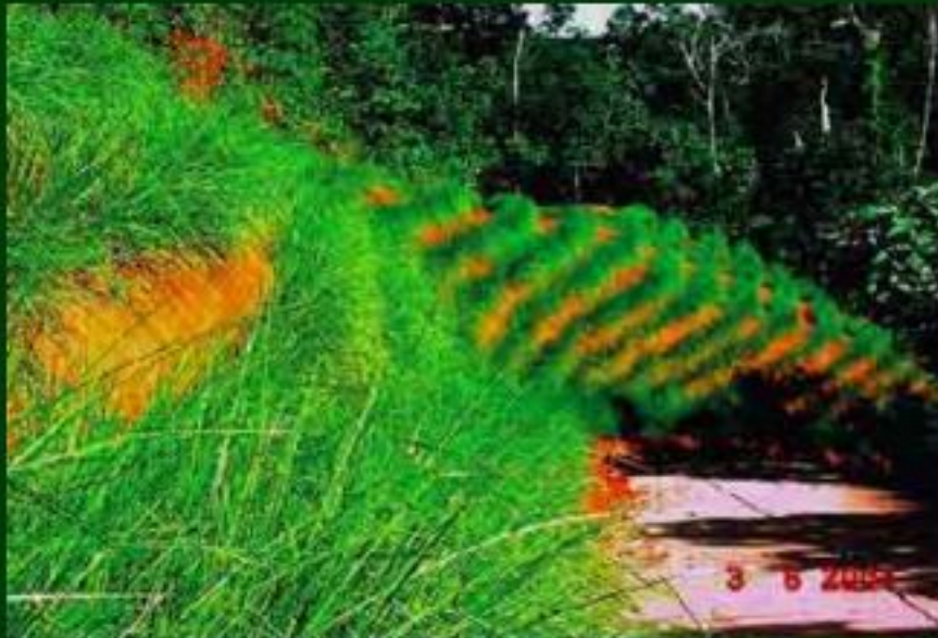
Left -Venezuela - Rehabilitation of bauxite mine using Vetiver Systems