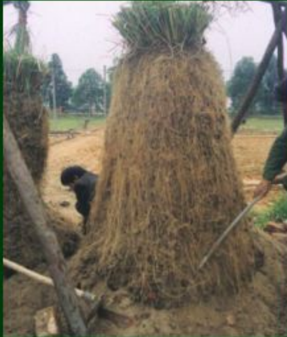
China - excavated root