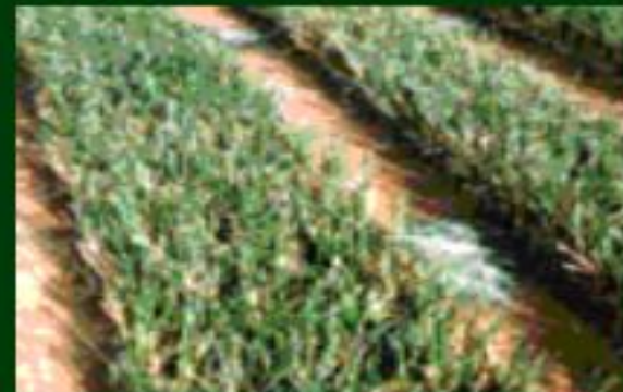
Malaysia - containerized vetiver nursery