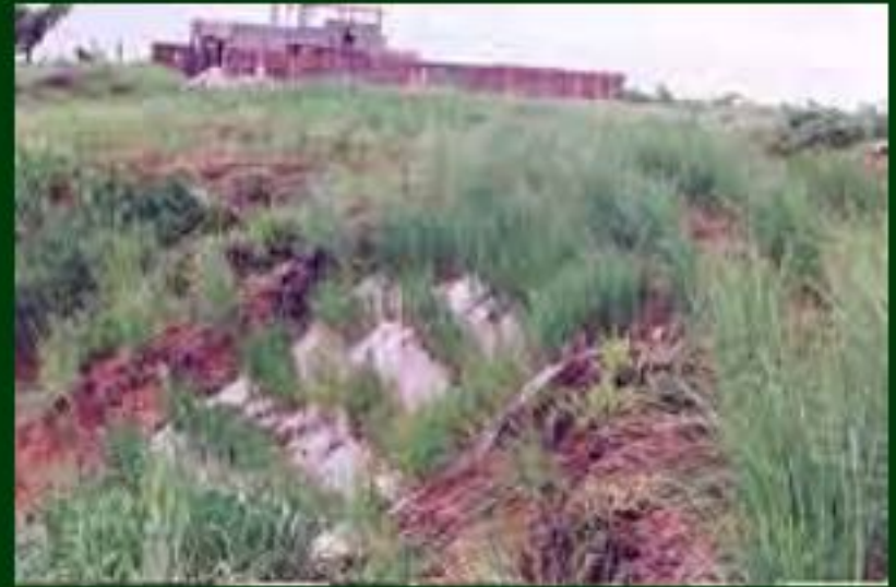
Mexico - Oaxaca. Stabilizing a cliff with vetiver