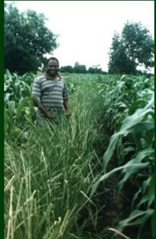
Malawi - Erosion control on maize field