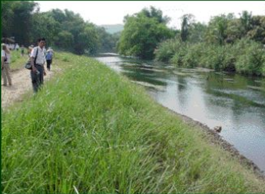
Thailand - River bank protected with Vetiver