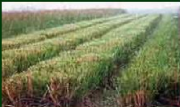
China - 20 ha nursery - bare rooted plants

If large quantities of plant material is required nurseries have to be established.