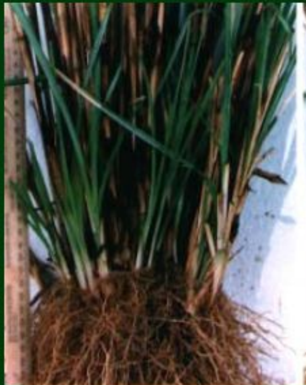
Malaysia - close up Clump grass