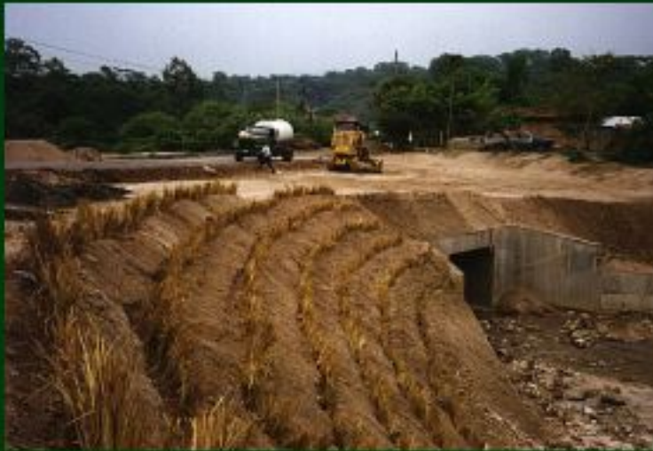
El Salvador - VS for bridge/culvert protection. Newly planted vetiver hedgerow