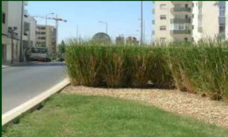
Portugal - Lagos. VS used to prevent head light glare from traffic on a divided road