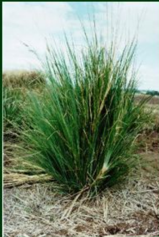
Australia - Queensland