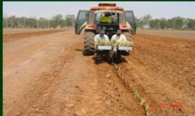
Australia - machine planting