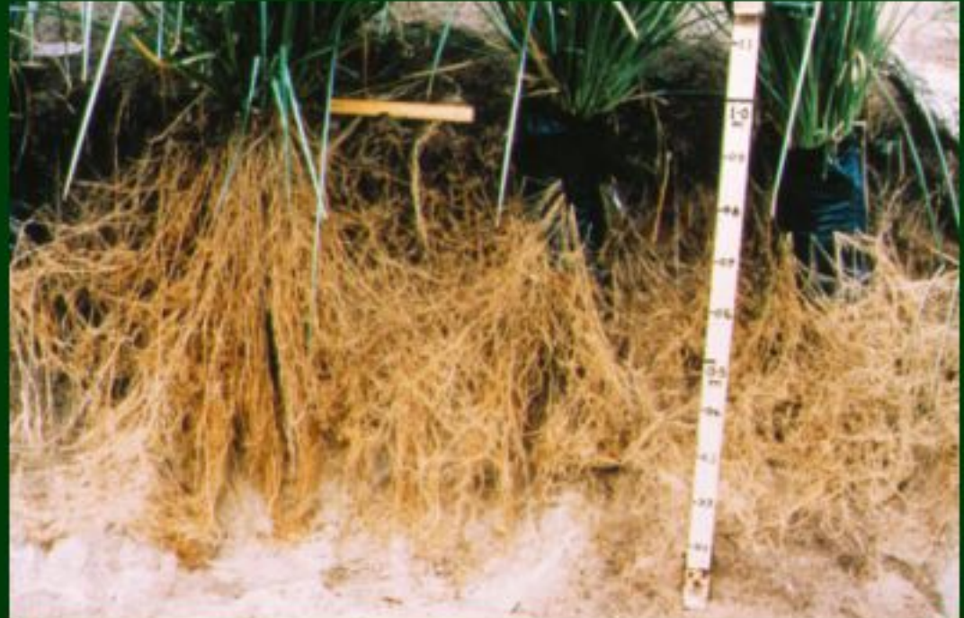
Malaysia - longitudinal section through hedge note the root mass in the top meter of the soil profile