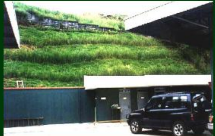
El Salvador - Landscaping and slope stabilization at an urban gas station.